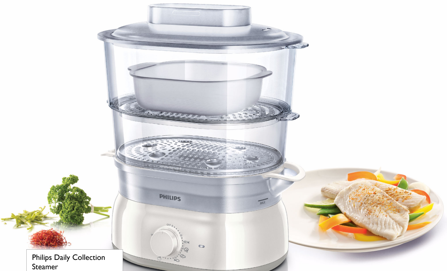
Philips Daily Collection Steamer